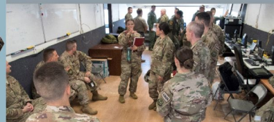
The 621st & 321st Air Mobility Operations Squadrons (AMOS) deploy Air Mobility Division expertise.

Air Mobility Operations Squadron (AMOS) Conduct theater-wide command and control (C2) and planning in order to execute large-scale DoD movements in support of Chairman of the Joint Chiefs of Staff (CJCS) - directed operations.