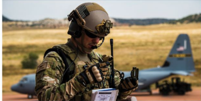
The 621st Mobility Support Operations Squadron Air Mobility Liaison Officers (AMLOs) advise and liaise with U.S. Army and Marine Corps units.

Mobility Support Operations Squadron (MSOS) Conduct tactical command and control (C2) support operations for U.S. Army and Marine Corps personnel in the field, expediting movement of Joint personnel and equipment aboard Air Force assets.