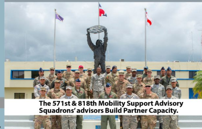
The 571st & 818th Mobility Support Advisory Squadrons' advisors Build Partner Capacity.

Air Mobility Operations Squadron (AMOS) Conduct theater-wide command and control (C2) and planning in order to execute large-scale DoD movements in support of Chairman of the Joint Chiefs of Staff (CJCS) - directed operations.