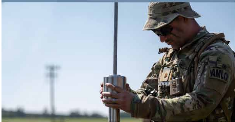
The 621st Mobility Support Operations Squadron Air Mobility Liaison Officers (AMLOs) advise and Liaise with U.S. Army and Marine Corps Units.