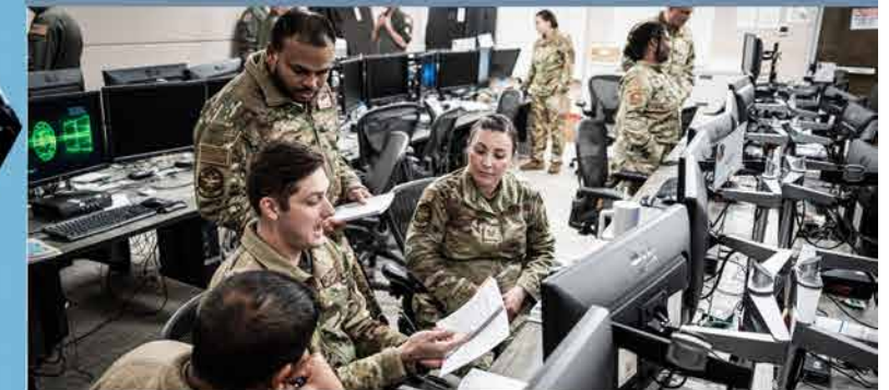
The 621st and 321st Air Mobility Operations Squadrons deploy Air Mobility Division expertise