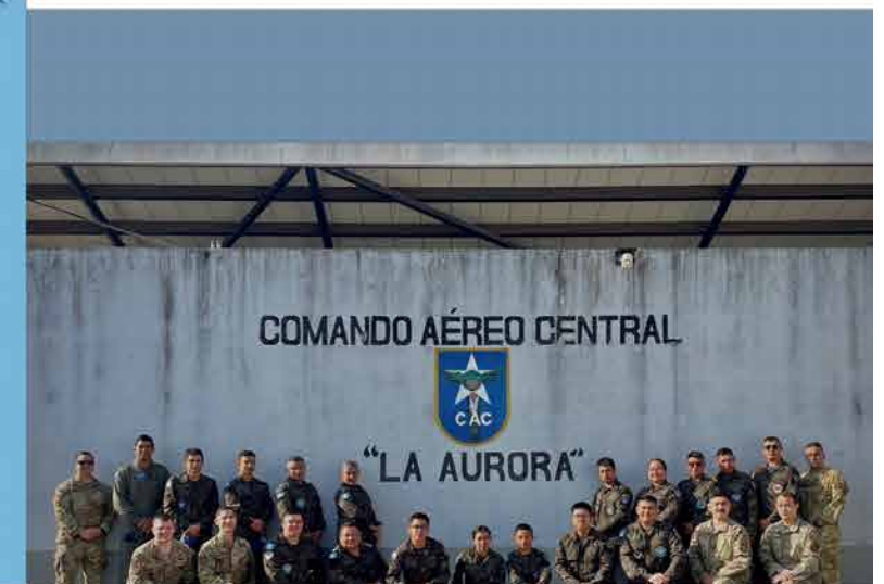
The 571st and 818th Mobility Support Advisory Squadrons' advisors Build Partner Capacity

Conduct theater-wide crisis augmentation of CCMD's air mobility command and control and planning to execute large-scale DoD movements in support of CJCS-directed operations.