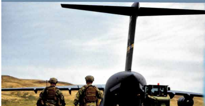
The 821st and 621st Contingency Response Groups generate CR Forces that open, operate and close airfields.

The MSOS is comprised of Air Mobility Liaison Officers (AMLOs) and Expeditionary Air Ground Liaison Elements (EAGLEs) who provide air mobility expertise to expedite movement of joint personnel and equipment aboard Air Force assets.