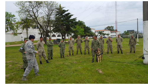
The 571st Mobility Support Advisory Squadron works with the Uruguayan Air Force on training military working dogs in Carrasco, Uruguay.

The 4 courses provided the starting point to continue and improve search and rescue operations within Uruguay and Africa, and to keep both the military and civilian population safeguarded. Our Air Advisors remain ready to continue to answer the demand signal of building capabilities in Uruguay for years to come.